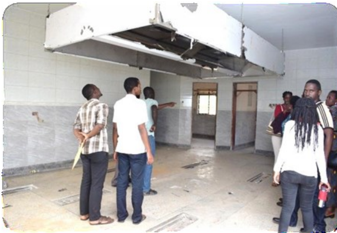
Kitchen and dining hall

Currently enrolled students are 31 in number, and will be starting their first intensive week of study in July (15 th to 19 th )